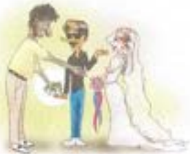
Ang pag-aalok sa isang dayuhan ng isang Pinay upang pakasalan, kapalit ang pera o ar-arian...