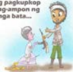
Ang pagkukpok o pag-ampon ng mga bata...