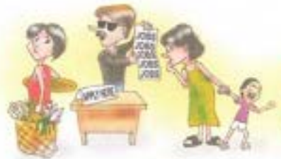
Ang paghihikayat ng mga tao...