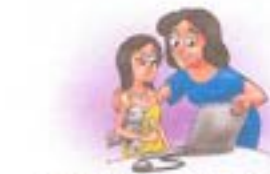
sekswal na pang-aabuso at pananamantala sa bata gamit ang internet at teknolohiya.