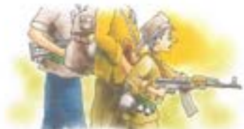
sa armadong pakikibaka sa Pilipinas o sa ibayong dagat.

1343 ACTIONLINE AGAINST HUMAN TRAFFICKING