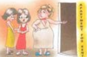
Ang pagtanggap o pagkanlong ng mga tao...