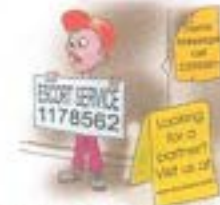
Ang pagpapa-anunsiyo, paglalathala o pamamahagi ng materyales na nagtataguyod ng human trafficking...