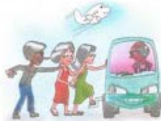
Ang pagbibiyaha o paglilipat ng mga tao...