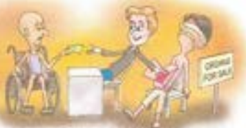
pagbebenta o pagtanggap ng anumang bahagi ng katawan ng tao.